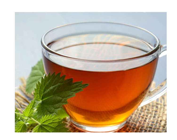
Tea ~10 items