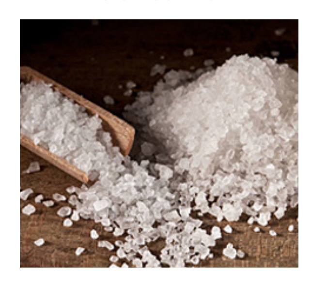
Sugar ~5 items