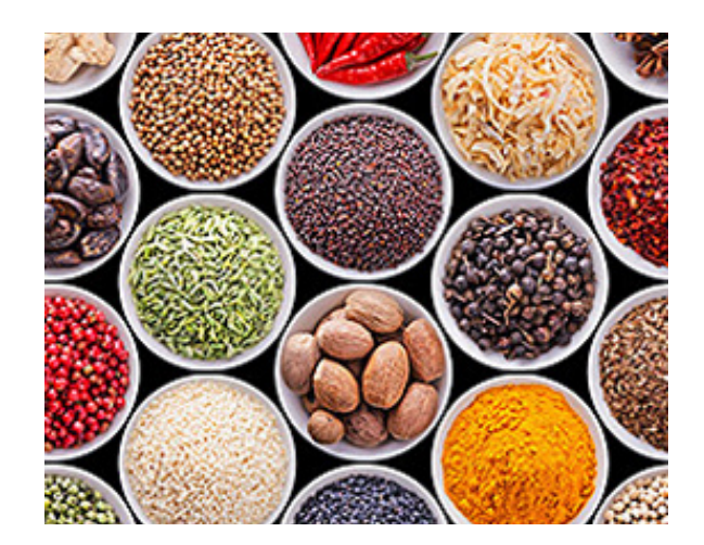
Spices ~200 items

Diwan Group offers a wide variety of products under their own brand: