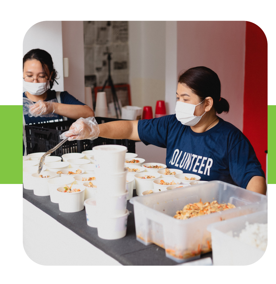
Food Distributors, Catering Companies, and Hotel Chains