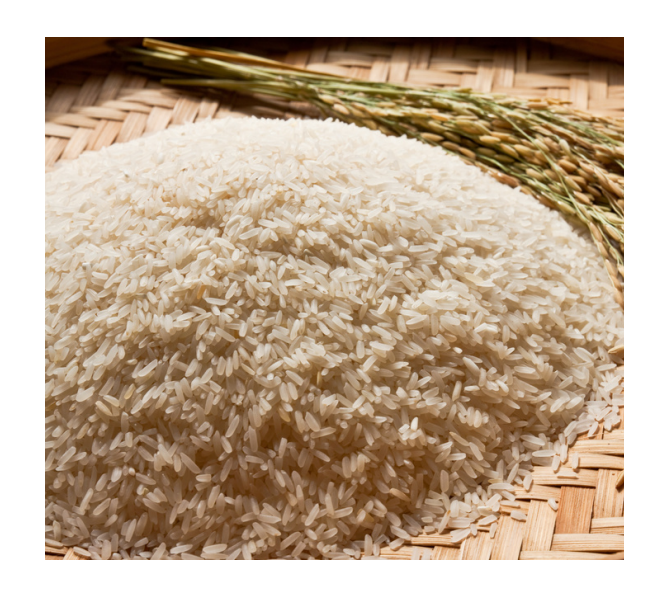
Rice ~30 items