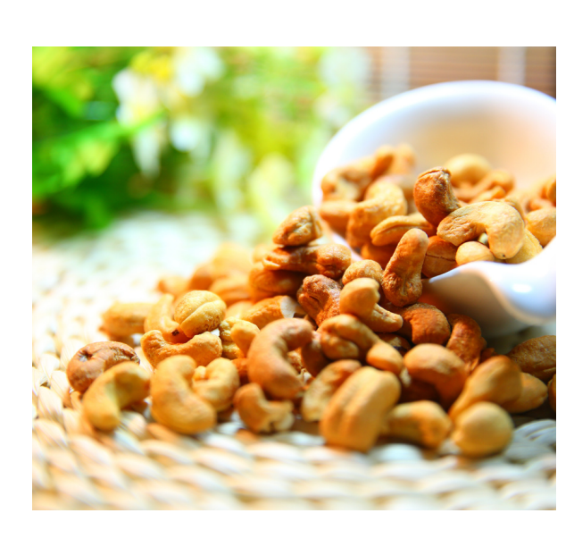
Nuts ~30 items