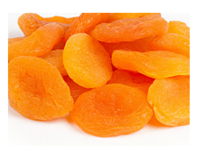
Dried Fruits ~50 items